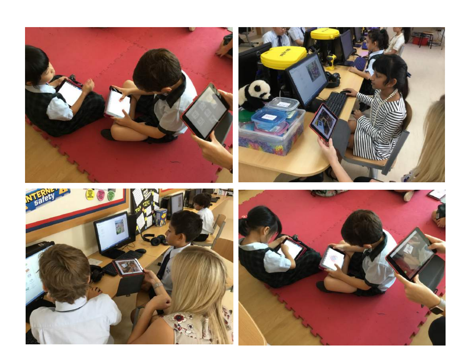
App smashing with Seesaw