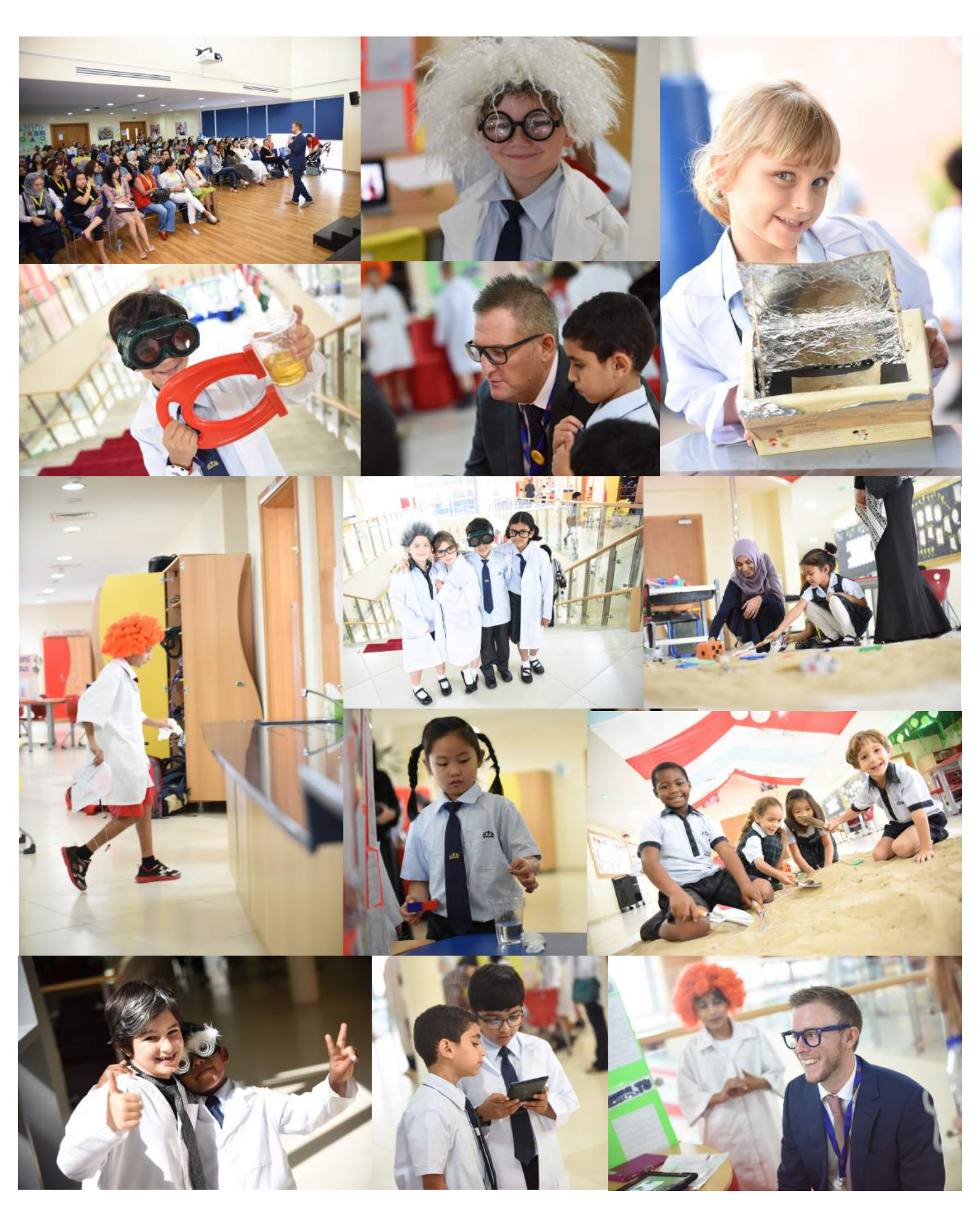
KSNAS Science Fair - Sep 2017