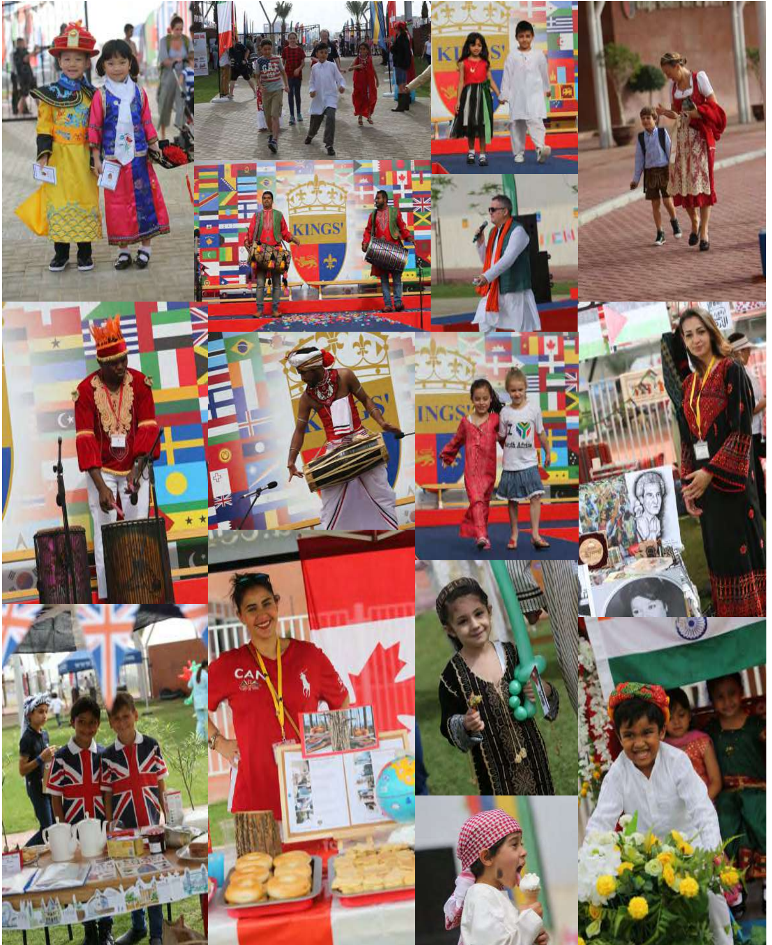
KSNAS International Day - March 2017