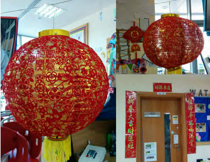
Gong Xi Fa Cai