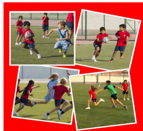
Action from U9 Touch Rugby Tournament

This term, Touch Rugby has been one of our sports in focus. This fast paced, non-contact version of the game has proved very popular among our children with almost 30 children from Year 2 to 6 attending Touch club every Sunday. They have been developing their skills and learning the rules of the game before putting them into practice in our Touch Rugby tournaments. These tournaments, another initiative driven forward by the PE team, has seen over 20 schools visiting us weekly to compete in the event, which is heavily focused on developing skills and playing the game in a fun and friendly environment.