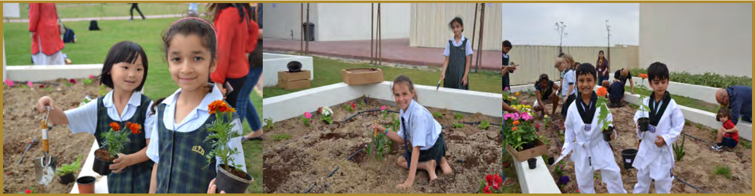
Let's Get Planting