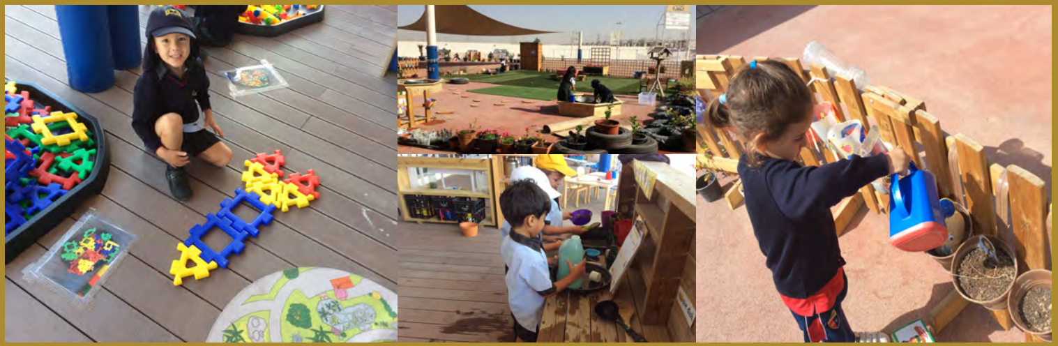
FS Developed Outdoor Area