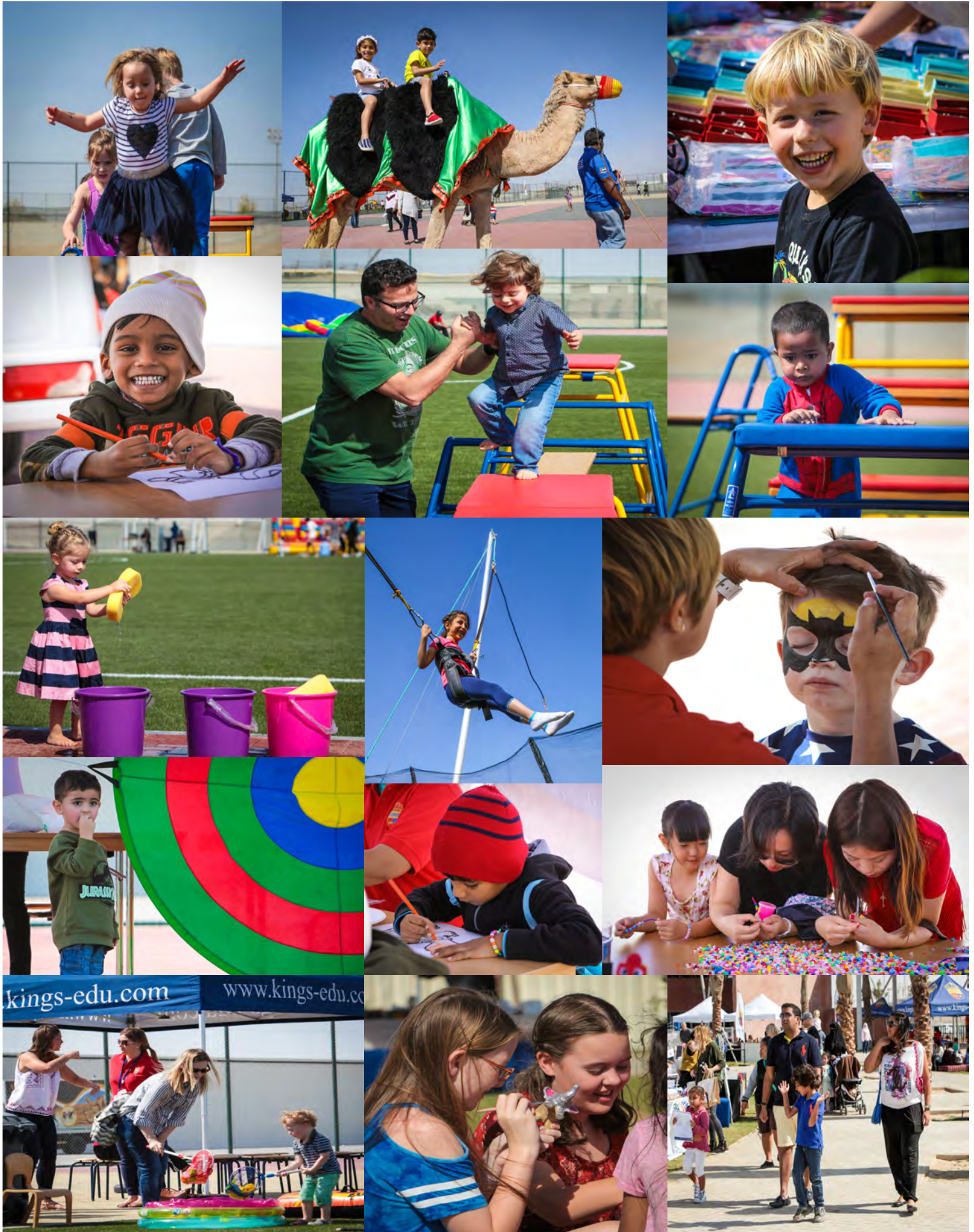
KSNAS Family Fun Day - January 2017