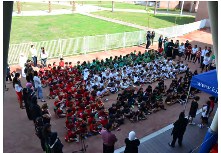
UAE Flag Day