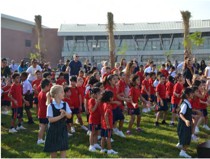
Wake and Shake