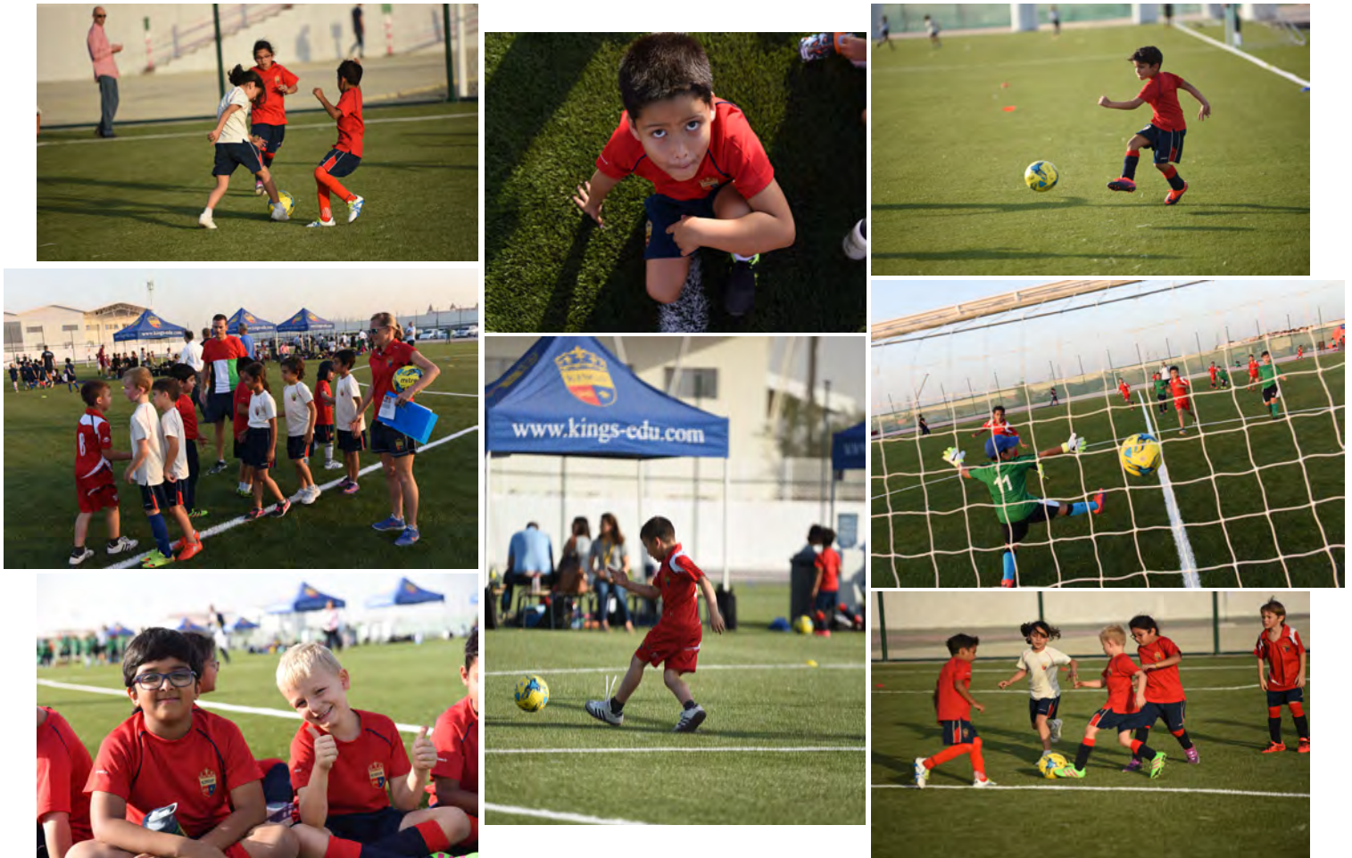
U8-U9 Football Development Festival

The Swim squad participated in their first home development gala in November. Swimmers competed against children from three other schools enabling them to practice their newly developed swimming skills in a competitive environment. We were extremely proud of all the swimmers especially as many achieved personal bests in their races.