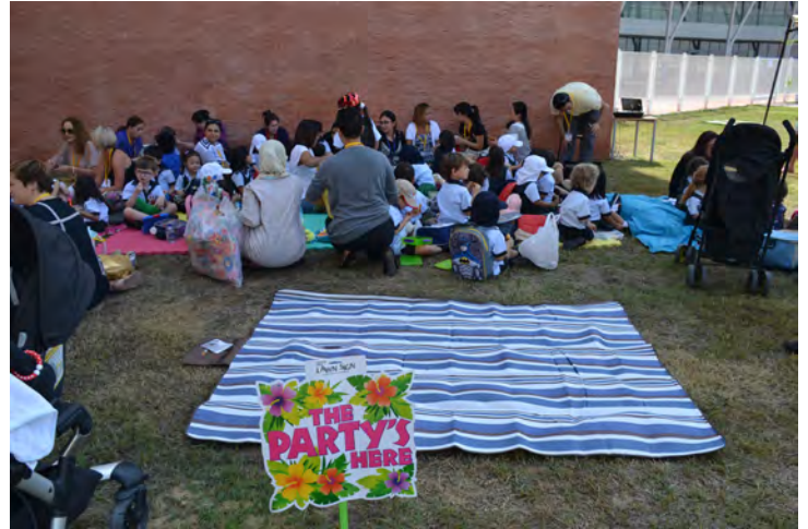
Teddy Bear Picnic